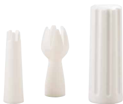
Decorator tips and charger holder included