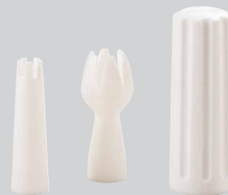
Decorator tips and charger holder included