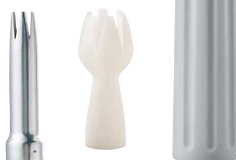
Decorator tips and charger holder included