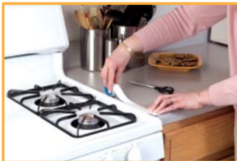
1. Measure and cut tape to fit

UPC-8-58748-00043-7 Item # 437 White Case Pack:12