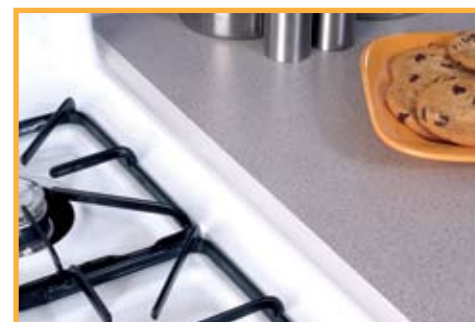
4. No more mess!