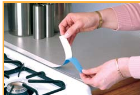
2. Remove tape liner