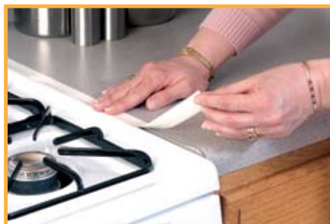
3. Apply tape over gap